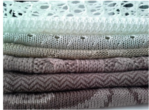
Photo: Innovative qualities with new looks for windows and seating from Giorgio Piovano.

Giorgio Piovano from Chieri (Italy) is enhancing the range of new Trevira CS collections with a series of interesting knitted developments. A variety of innovative fabric constructions supply a wide range of soft-hanging materials for drapes, curtains, cushions and upholstery fabrics. Even light qualities have good stability and abrasion values and, despite their transparency, are suited for sun-screening, while offering a degree of soundproofing.