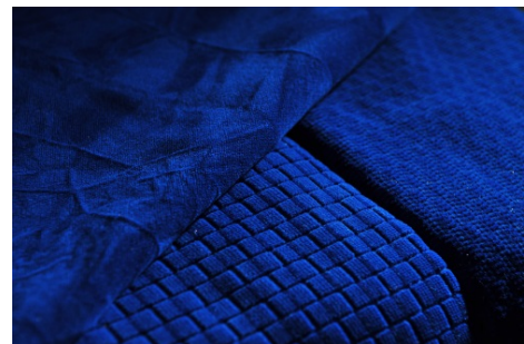
Photo: High-end velour fabric by Spandauer Velours.

Spandauer Velours from Lichtenstein (Germany) produces a wide range of high-value velour fabrics for decorative and upholstery fabrics, especially for the contract market.