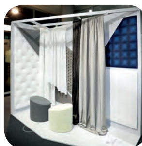
Trevira CS Fabric Creativity Competition 2016: 3D Lab at Heimtextil