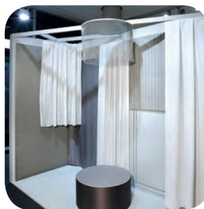
Trevira CS Fabric Creativity Competition 2016: Techno Lab at Heimtextil