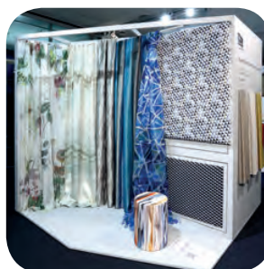
Trevira CS Fabric Creativity Competition 2016: Digital Lab at Heimtextil