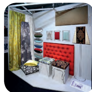
Trevira CS Fabric Creativity Competition 2016: Artisan Lab at Heimtextil