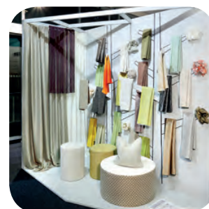
Trevira CS Fabric Creativity Competition 2016: Sensuous Lab at Heimtextil